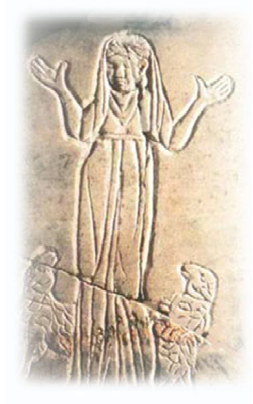
Archeological evidence of faithful women dating back to at least the 2nd century.